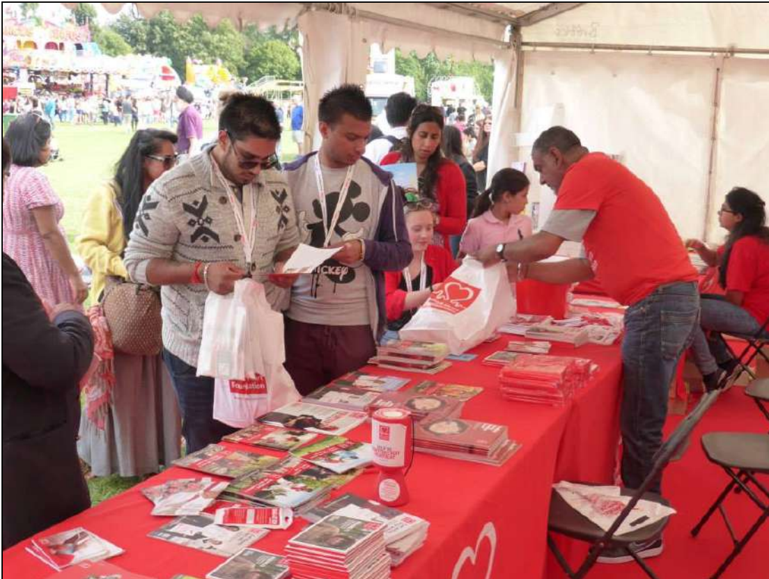
SCA staff at the British Heart Foundation stall at the London Mela in Gunnersbury Park.

During this year we arranged three Forum meetings on 20 June 2013 and 29 January and 27 March 2014. In the meetings there was a repeated focus upon local policing priorities, Ealing Hospital, provision of recreational facilities and youth provision. The meetings were attended by 83 residents in total and attending organisations included : Horn of Africa Disability Elderly Association, Indian Workers Association, St John's Church, Golden Opportunities Youth Association, Punjabi Theatre Academy, Helpink, A Rocha, Southall FC, London Tigers, Samafal Community Association etc.