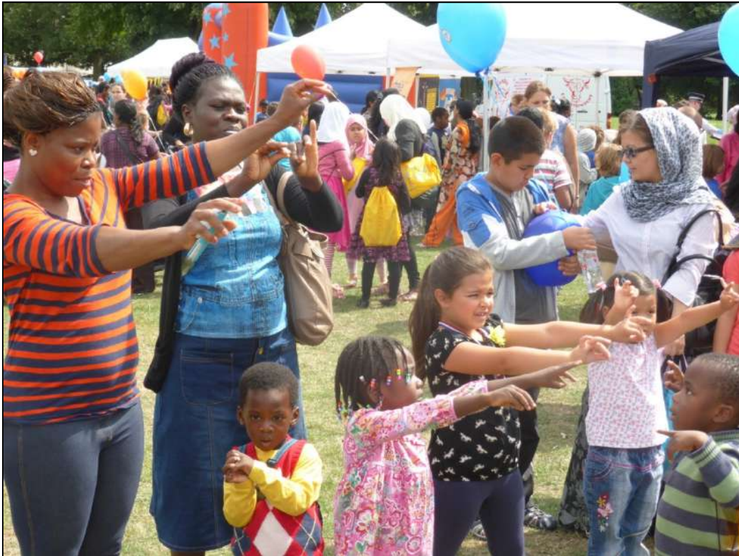
Southall residents, young and old, enjoying the first 'Southall Playday' event in Southall Park in August 2013