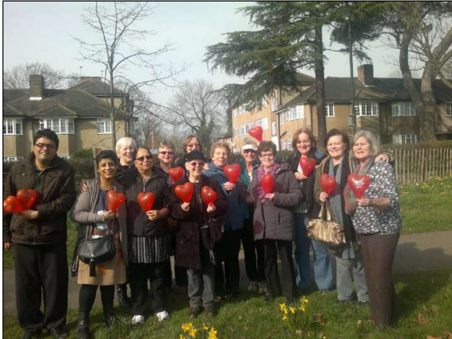
Satisfied customers ! A happy bunch of walkers in Bunny Park, who exercise regularly as part of SCA's borough wide health walks scheme.