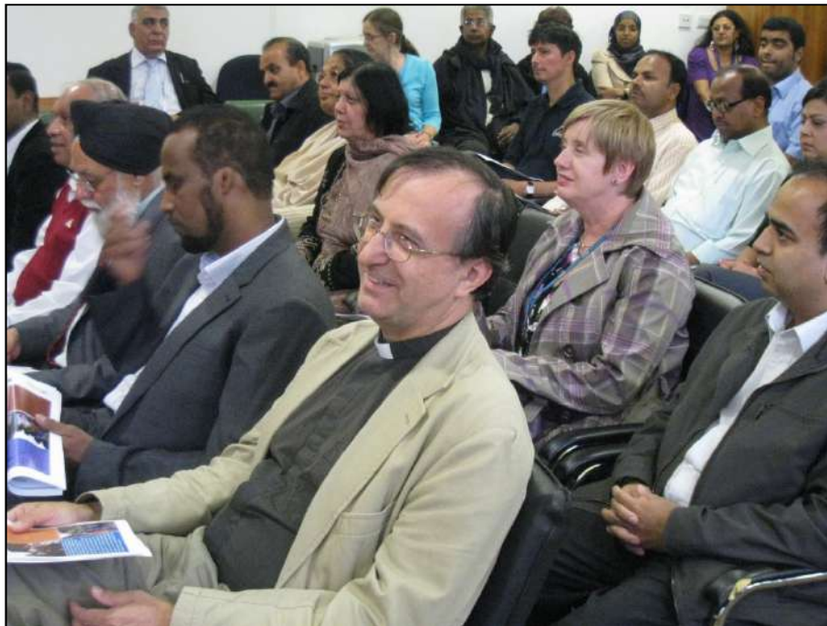
A meeting of the SCA Community Forum taking place at the Town Hall in August 2011.

The work of SCA and Acton Community Forum over the past few years, in aiding and assisting supplementary schools has yielded many benefits, not least of all for the hundreds of young people who attend the various supplementary schools each week. There is no doubt that these schools faced a greater level of scrutiny than ever before about the educational benefit of their work with children. SCA and ACF were able to work with a number of local partners and contribute to research commissioned by the John Lyons Charity to demonstrate this very link. There is no doubt that as well as the ever present resourcing problems faced by many groups, there will be an additional future focus upon demonstrating better links with mainstream schools in Ealing.