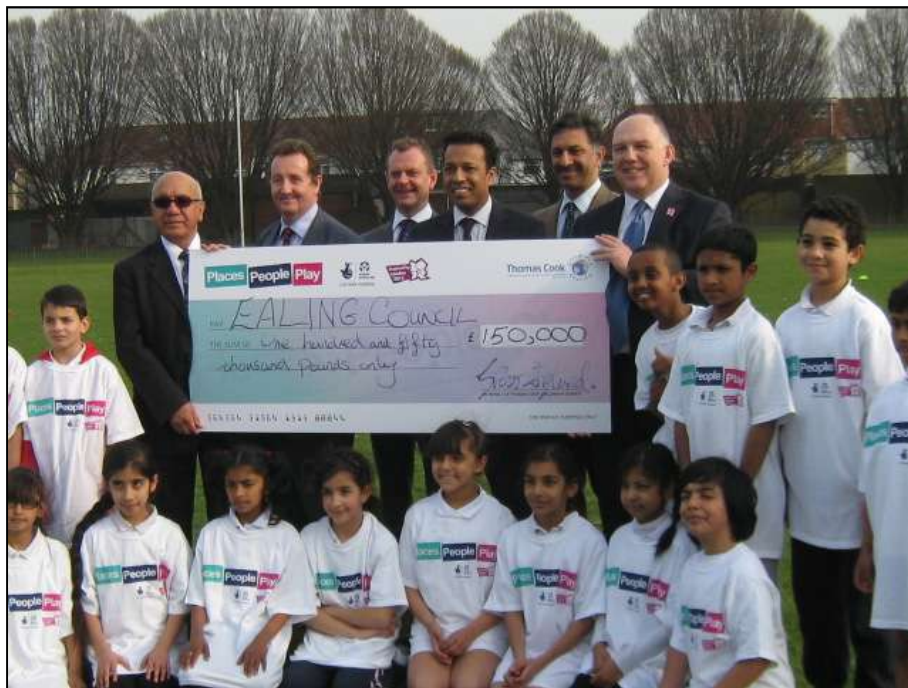
More success at Spikes Bridge Park as Sport England deliver a £150,000 cheque, also enjoyed by pupils from Lady Margaret Primary School.

We had the opportunity to represent the voluntary and community sector on the Faith & Diversity Sub group of the Ealing Safeguarding Board. Overall, as the year progressed, we become aware of some changes within the practising communities, especially amongst the older generation. One of our key considerations was to challenge the assertion that the practice is legitimate within Sharia'-Sunna law, whilst current legislation clearly makes the practice illegal. These were noted as we have had a few girls calling us regarding the matter and at the end we have referred them to the Acton African Well Woman Clinic.