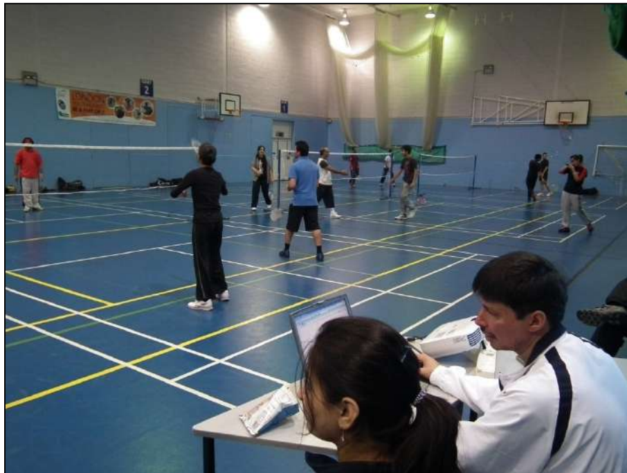
The "Smash It" badminton competition at Southall Sports Centre in February 2012, funded by the Garfield Weston Foundation.