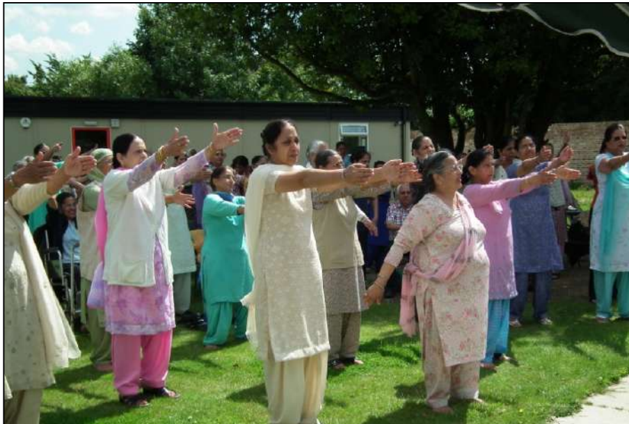
Outdoor exercise and sunshine being enjoyed by the Mael Gael elderly group at Norwood Hall in Southall.