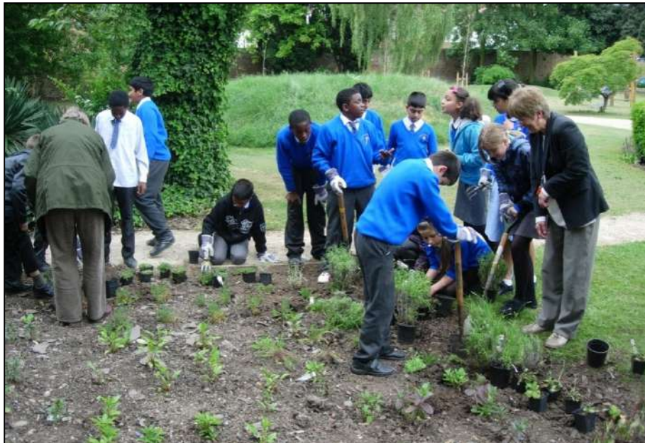
Young students of St Anselm's School working hard on developing a community plant garden as part of the 'Wild Things' project.