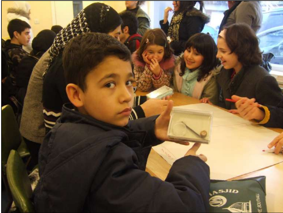
Keen young Iranian and Afghani children at an activity session arranged by the Bahar Centre at SCA