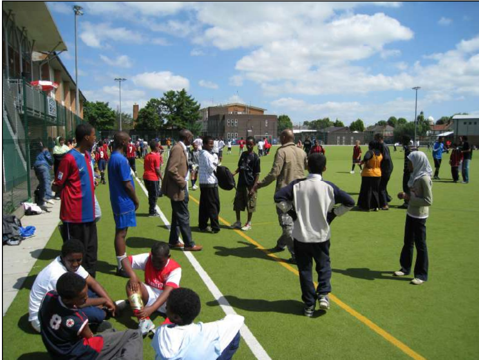
Eager young participants at the Unity Cup football competition at Featherstone High School in June 2008