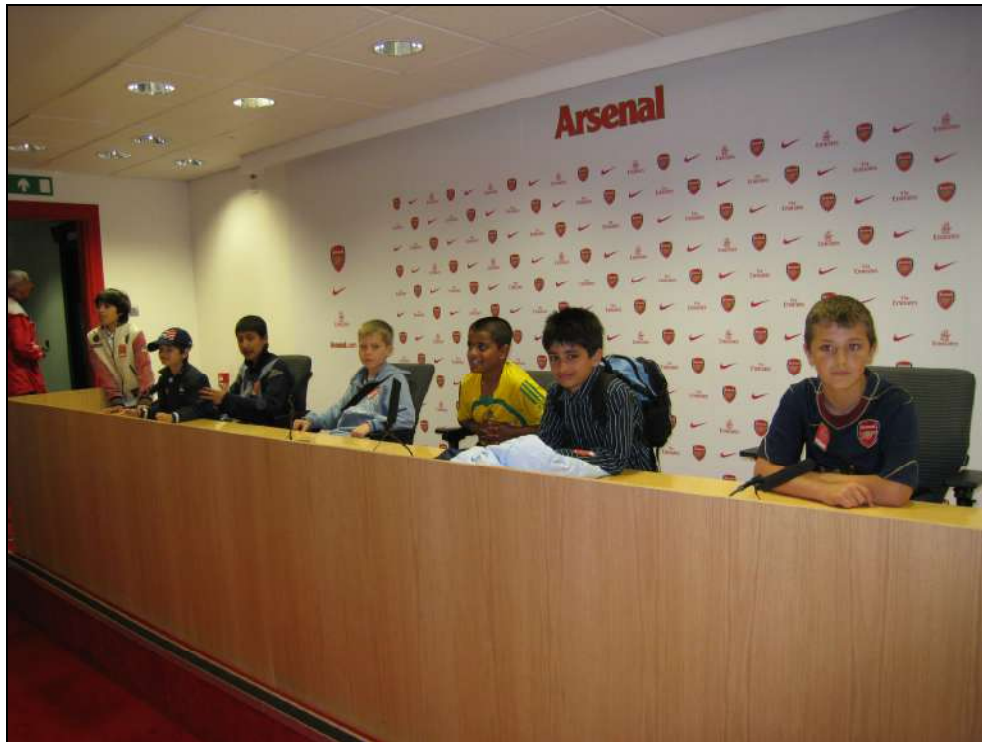
SCA arranges trip to the Emirates Stadium for Southall children, with assistance of Havelock Family Centre and the Russian Circle

It is worth noting that the funding for this project is also not secure beyond next year so SCA will be working hard to sustain and build on the projects successes by obtaining alternative funding beyond 2010.