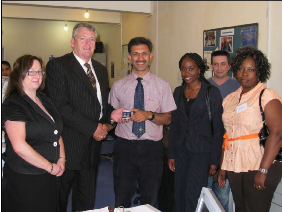
SCA and Acton Community Forum hosting a meeting with colleagues from Ireland visiting Southall